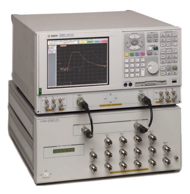
PNA Series network analyzer with 87050A H16

High performance wireless infrastructure components demand the highest performing multiport test solutions available. A range of solutions is available from the simple 3 port duplexers to more complex combiner/divider units (CDU) and multi-carrier power amplifier (MCPA) delay filters. Infrastructure components have a common need for high dynamic range, fast measurement speed and low measurement uncertainty to correctly characterize their performance. Solutions are available that combine the best accuracy with the convenience of multiport connections and electronic calibration.