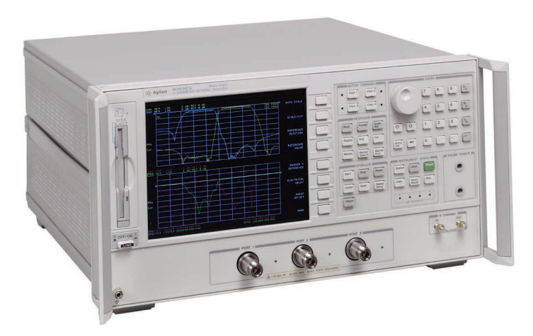
8753ES option H39/006

During design and final alignment of duplexers, it is often necessary to see both the transmit-antenna and antennareceive paths together, since tuning the response of one path frequently affects the response of the other path. With an Agilent duplexer test solution both paths can be displayed simultaneously, with a single RF connection to each port. Since design verification and final test and alignment have different requirements, Agilent offers solutions with each in mind.