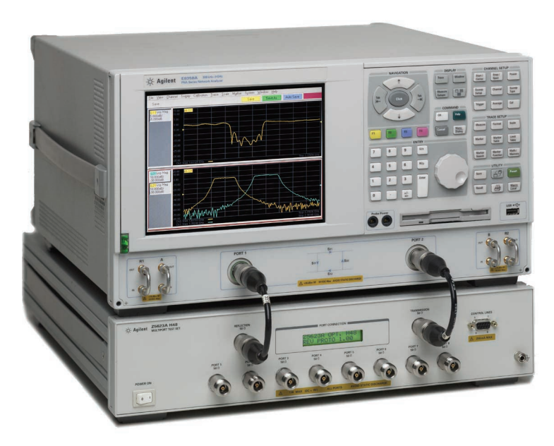
PNA Series network analyzer with Z5623A H48

The never-ending trend to decrease size and cost is leading to many RF front-end passive and active components being integrated in a single compact module. This configuration has new measurement challenges to be considered. Modules designed to use low temperature co-fired ceramics fabrication technology (LTCC) such as switchplexers and multiplexers must be tested exceptionally fast while maintaining high levels of accuracy and high repeatability to achieve high production volumes. Network analyzer sweep speed is only one factor that contributes to the overall throughput that can be achieved in multiport devices with multiple measurement paths. The overall throughput depends on how quickly the system can transition from one measurement path to the next and process that data. These solutions optimize key hardware, firmware, and software features to achieve exceptionally fast measurement speeds.